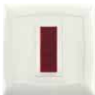
Flat indicator red