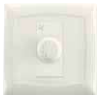
Fan regulator 1 module