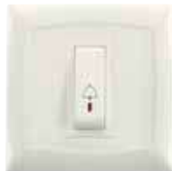
Bell push with indicator - 1 module