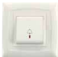
Bell push with indicator - 2 module