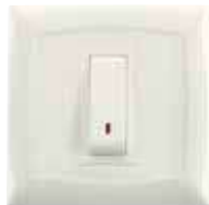
Switch with indicator 6 A, 16 A, 25 A