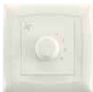
Fan regulator 2 module