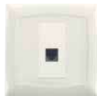
RJ 11 Telephone socket