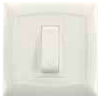
Switch 6 A two-way