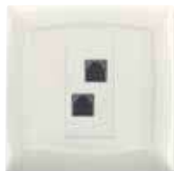
Double RJ 11 Telephone socket