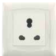
6/16 A socket