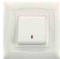
DP Switch 20 A, 32 A