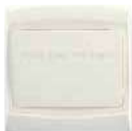
Key card Switch 15 A