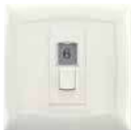
Bell call indicator