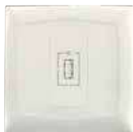
USB charger 1 module