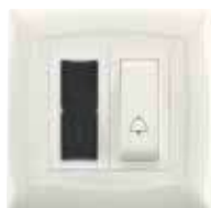
DND external unit