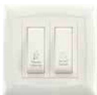
DND internal unit