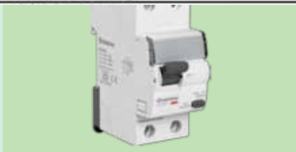
FP RCCB 'AC' Type